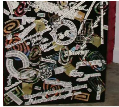
Entrada a la Vida: A collaborative door project