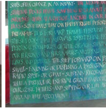
By Jacqueline Lacey

Above: Doors created by SDFC members now on display at the Escondido Municipal Gallery. See article on page 2.