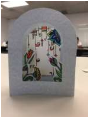
Above: Front view of tunnel card. There is space on the front arch to add your calligraphed message.