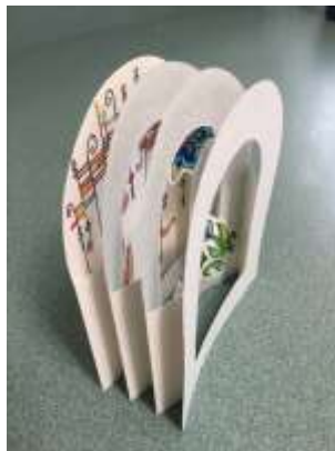
Above and below: Left and right views of tunnel card