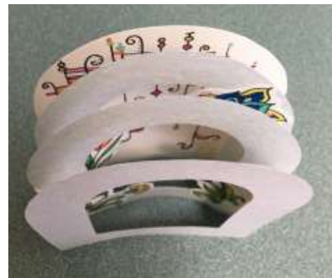
Above: Top view of tunnel card