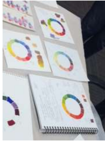
Above: Samples of color wheels